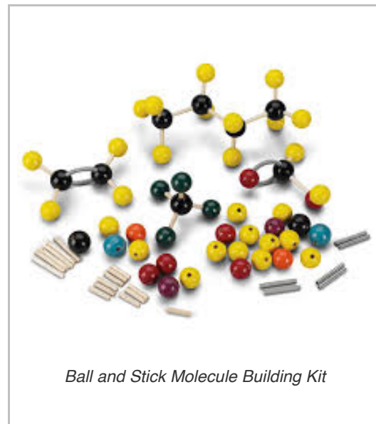
Ball and Stick Molecule Building Kit

Hints: an ether is formed when an oxygen has a carbon on both sides such as C-O-C. An aldehyde is formed when a carbon is attached to a hydrogen and double bonded to an oxygen such as H-C=O. A ketone is formed when the C=O is in the middle of a chain of carbons. A carboxylic acid is formed when a carbon is double bonded to one oxygen and attached to a second oxygen by an -O-H group, such as H-O-C=O. The -O-H group on its own makes an alcohol . The prefixes meth- eth- prop- but- pent- hex- hept- oct- non- dec- represent increasing numbers of carbons, from 1 to 10.